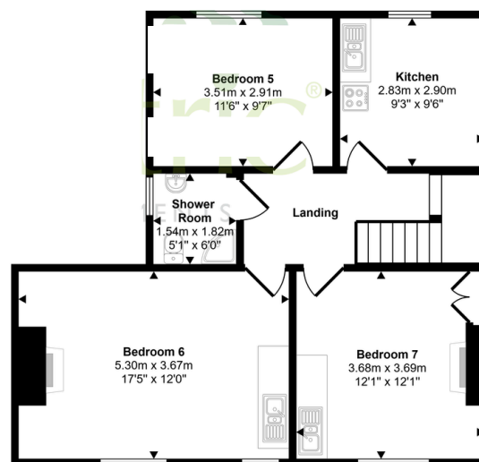
First Floor Approx 66 sq m / 709 sq ft

This floorplan is only for illustrative purposes and is not to scale. Measurements of rooms, doors, windows, and any items are approximate and no responsibility is taken for any error, omission or mis-statement. Icons of items such as bathroom suites are representations only and may not look like the real items. Made with Made Snappy 360.